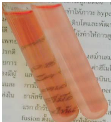
Fig. 1. Interpretation of the osmotic fragility test (OF-test). Clear (left: negative test) or turbid (right: positive test)

The osmotic fragility test (OF-test) was done as described by Panyasai et al (2002). The test was applied to the groups of subjects who were also investigated for complete blood counts (CBC). A sample of 20 \mu l whole blood was pipetted and mixed well with 2 ml of 0.34% buffered saline solution at pH 7.4 and allowed to stand at room temperature for 15 min before interpretation. The tests were evaluated by visualization as negative and positive. Negative samples were characterized by a clear red hemoglobin solution indicating complete hemolysis of the red cells in the solution whereas positive samples were identified by a cloudy or smoky appearance because of incomplete hemolysis of the red cells (figure 1). Suspicious samples with a very fine cloudiness considered as positive. To estimate the percentage of hemolysis, the test tube was centrifuged for 5 minutes at 500 x g and the hemoglobin in the supernatant solution was measured manually by absorbance (optical density) at 540 nm using UV-visible spectrophotometer. The results of the visualized interpretation and percentage of hemolysis in the solution were as follows: negative corresponded to 91 to 100% hemolysis and positive to 86 to 90 % hemolysis. Means and standard deviations of the hematologic analysis data and the osmotic fragility test (OF-test) of the healthy and anemic values were calculated and then compared by a paired t -test.